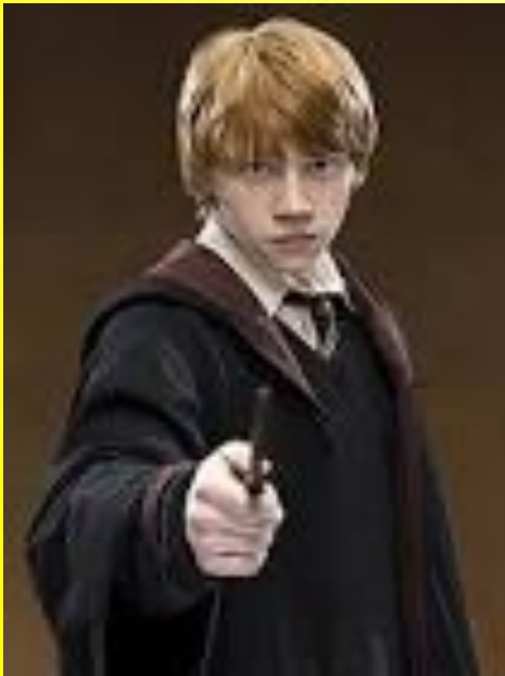
Name: Ron Weasley